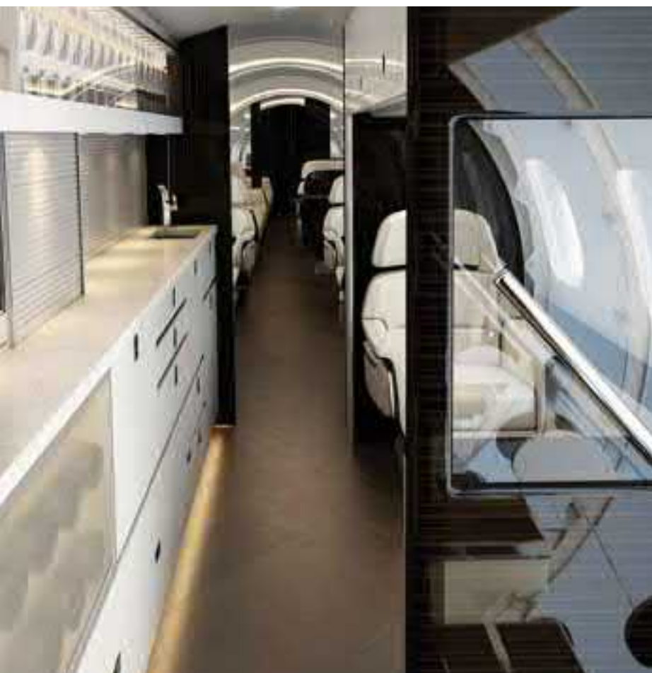
DESIGNED BY DESIGN O